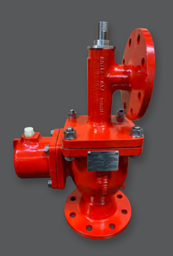
GA/FIG: 8340 3" Double Orifice Flanged ANSI 300# Hastelloy Air Valve c/w adjustable throttling device, coated in Shell approved marine epoxy coating.

Our range of WRAS approved HiVent Air Valves are available in a variety of materials including: Titanium, Stainless Steel, Duplex Stainless Steel, Bronze, 6Mo, accredited to Internationally recognised material standards