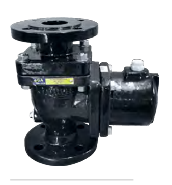
GA/FIG: 8340 WRAS Approved 2" Double Orifice Air Valve c/w Flanged outlet to pipe away.