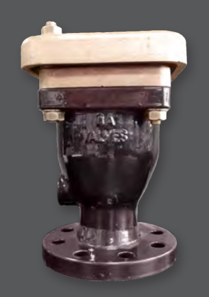
GA/FIG: 8320 2" Single Large Flanged ANSI 300# Ali-Bronze Air Valve, coated with black epoxy.