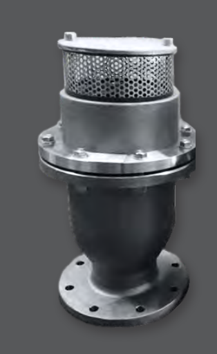
GA/FIG: 8320 6" 8320 Single Large flanged ANSI 150# Super Duplex Air Valve c/w Surge Check Device.