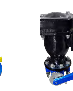
GA/FIG: 8340 WRAS Approved 80mm Double Orifice Air Valve Flanged PN16 c/w GA/ FIG:BF02 Lugged Tapped

A valve that perform the functions of both the 'Kinetic' and 'Automatic'.