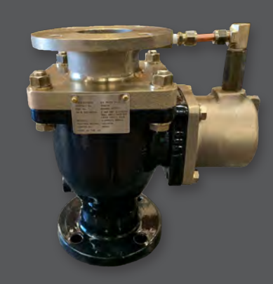
GA/FIG: 8340 4" Double Orifice Flanged ANSI 150# Ali-Bronze Air Valve c/w flanged piped outlet, coated with black epoxy.